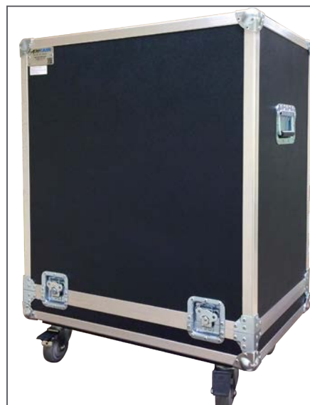
2700 heavy duty transport case.