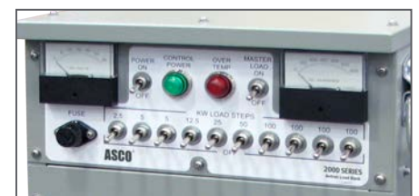
2700 shown with DC metering controls.