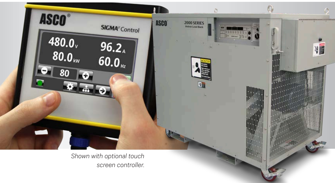
Shown with optional touch screen controller.

The ASCO Model 2805 (formerly Avtron LPH) Load Bank is designed for operation indoors when up to 500 kW of resistive load is required.